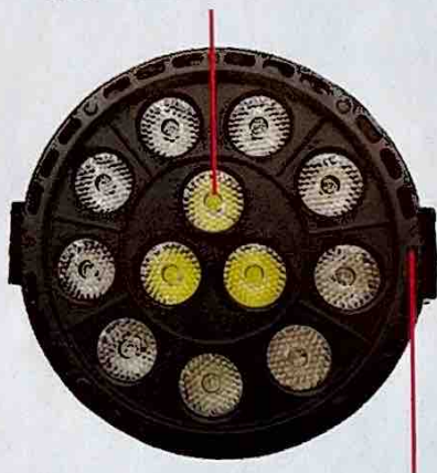
Remote Control Receiver